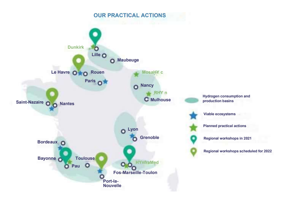
Extract from the FINAL REPORT ON THE NATIONAL LOW-CARBON AND RENEWABLE HYDROGEN MARKET STAKEHOLDERS' CONSULTATION

GRTgaz has built on these lessons to launch projects in the Fos-Marseille, Dunkirk, Moselle and Rhine Valley basins to develop pipeline transport infrastructure projects to support emerging hydrogen ecosystems. These are shown in the map below, which is taken from the consultation report available at the following link: <a href="https://www.grtgaz.com/medias/actualites/consultation-acteurs-marche-hydrogene-restitution">https://www.grtgaz.com/medias/actualites/consultation-acteurs-marche-hydrogene-restitution</a>